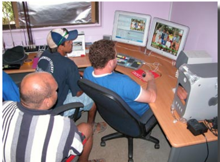
The Crew working on Apple's Final Cut Pro.