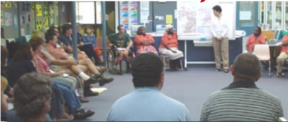
Teachers and other staff attended the workshop at the high school