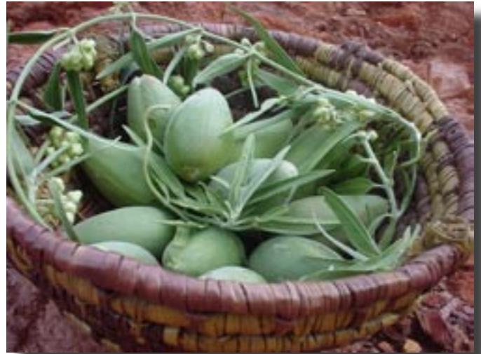
Ngarmagurtu: Bush Bannana

The CDEP women have been going out bush with Jake Gummow from the Media Unit, photographing and documenting local bush food. They are planning to produce a book with the photographs and local language (Waramungu) names for the food and plants and their uses. Mrs Nixon is very enthusiastic about this project and the completion of the book because it will be an important resource in order to learn about the local bush tucker