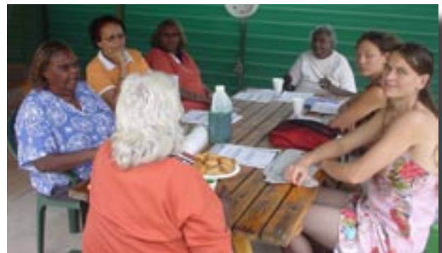
Cross culture workshop conducted for tourists