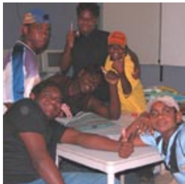
Above: The language classes conducted at the Language Centre

In addition to the language classes, the CDEP women have continued with the School program, where kids from mainstream classes learn about Wumpurani ways (Indigenous studies). Ongoing activities in conjunction with the Tennant Creek High School and PAK have been successful and have had a positive impact between the students, workers and elders.